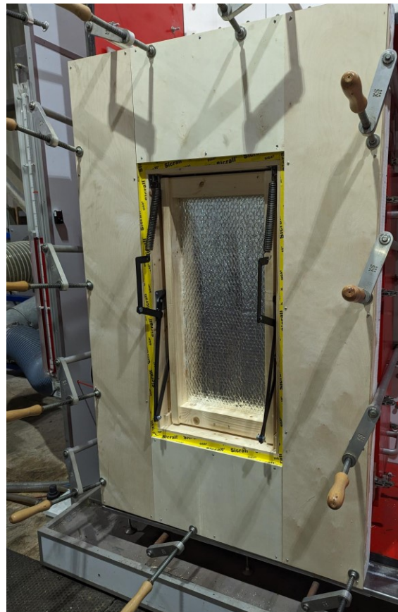
Picture 1: Test Sample During Test (Picture of test sample prior to testing)