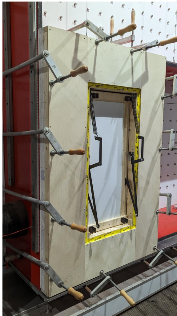
Picture 1: Test Sample During Test (Picture of test sample prior to commencing testing)